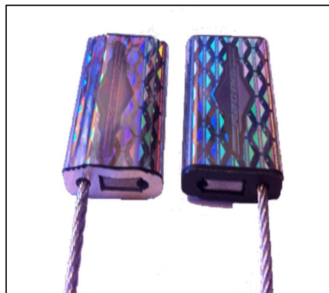
Seals can have either a black anodized or bare aluminium finish on both main body ends as shown.

There are two custom security seals with matching serialization installed from the factory. Tampering of the seals is not permitted. Should the seals be tampered with, the engine is no longer eligible for competition.